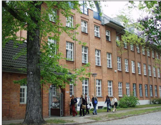
The IRS building in Flakenstraße, Erkner, can easily be reached from the centre of Berlin by regional express train.

The IRS co-operates at national and international levels with universities and extra-university research institutes. Co-operation agreements exist with the Brandenburg Technical University of Cottbus and Potsdam University. The IRS currently employs a staff of 65. 14 of the 40 scientists are working on externally funded projects.