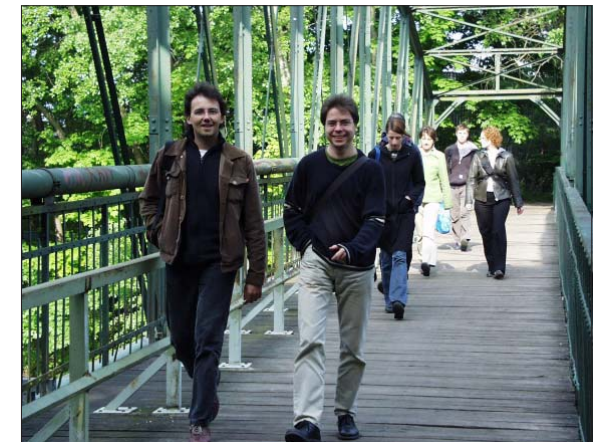
The pedestrian bridge crossing the Flaken river between the IRS and the S-Bahn railway station.

The IRS is a registered association. It is academically independent and is member of the extra-university research bodies of the Gottfried Wilhelm Leibniz Scientific Association (WGL). It receives funding from both the federal government and the state of Brandenburg on the basis of a general agreement on promoting research.